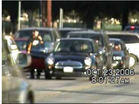
PARENTS...You can be the Traffic Hazard!!!

Do not double-park or stop in a lane of traffic. Pull ahead to find an open spot at the curb.